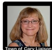
Town of Cary Liaison