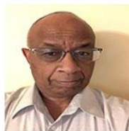
Will Robinson Programs