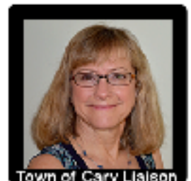
Town of Cary Liaison